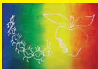
5 Star Printing Foam: see page 26

Place a sheet of paper over the painted printing foam. Using the palm of your hand press firmly all over, then carefully lift off the paper and leave to dry.